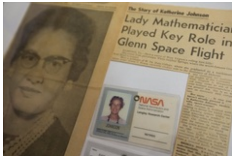
Katherine Johnson made headlines.

HAMPTON, Virginia (Achieve3000, February 25, 2019). Katherine Johnson worked for NASA. She started in the 1950s. She helped people go into space. She's a hero.