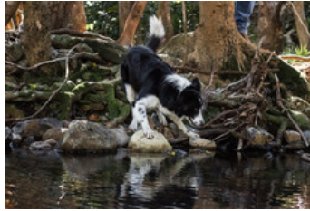
This dog can sniff out the scent of different animals on land and in water.

MELBOURNE, Australia (Achieve3000, December 4, 2019). Dogs sniff things out. They have a super sense of smell. It's much stronger than a person's! It leads them to find things.