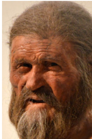
This is what Ötzi the Iceman may have looked like.

BOLZANO, Italy (Achieve3000, November 21, 2019). It was about 5,300 years ago. A man was on a mountain in Italy. He was hurt. And it was cold. Would he stay alive? He would not. But today, people are learning all about him. Here's why.