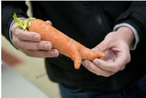
Does this carrot have a tail? A company is selling it anyway.

URBANDALE, Iowa (Achieve3000, May 6, 2019). Would you buy ugly produce? Many people wouldn't.