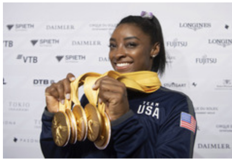
Gymnast Simone Biles shows off some of her gold medals.

STUTT GART, Germany (Achieve3000, October 24, 2019). Simone Biles is a gymnast. Maybe the greatest ever. How did she get to be great? With hard work.