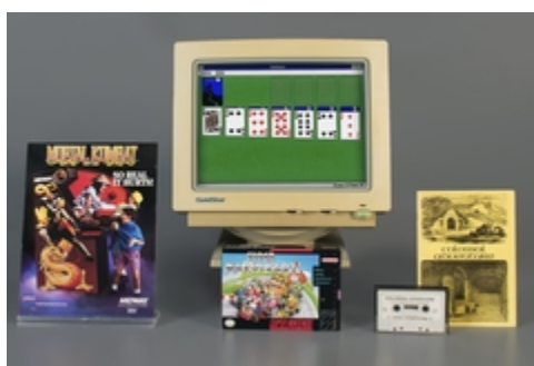
Each year, games are chosen for the World Video Game Hall of Fame.

ROCHESTER, New York (Achieve3000, May 10, 2019). There's a World Video Game Hall of Fame. It's in New York. It opened in 2015. Which games get in? Only the best! Some are old. But they're important. Take Colossal Cave Adventure . It's from 1976. It helped start computer gaming. Microsoft Solitaire is a computer card game. It's from 1991. It taught players how to use a mouse.