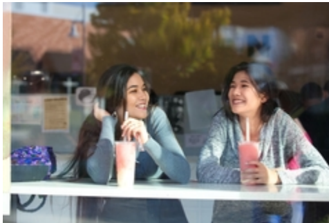
A bubble tea shop is a sweet spot to hang out.

TAIPEI, Taiwan (Achieve3000, May 7, 2019). Have you heard of bubble tea? It's a drink. But it's like a snack.